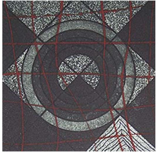
CROSSES 2006 etching and dry point