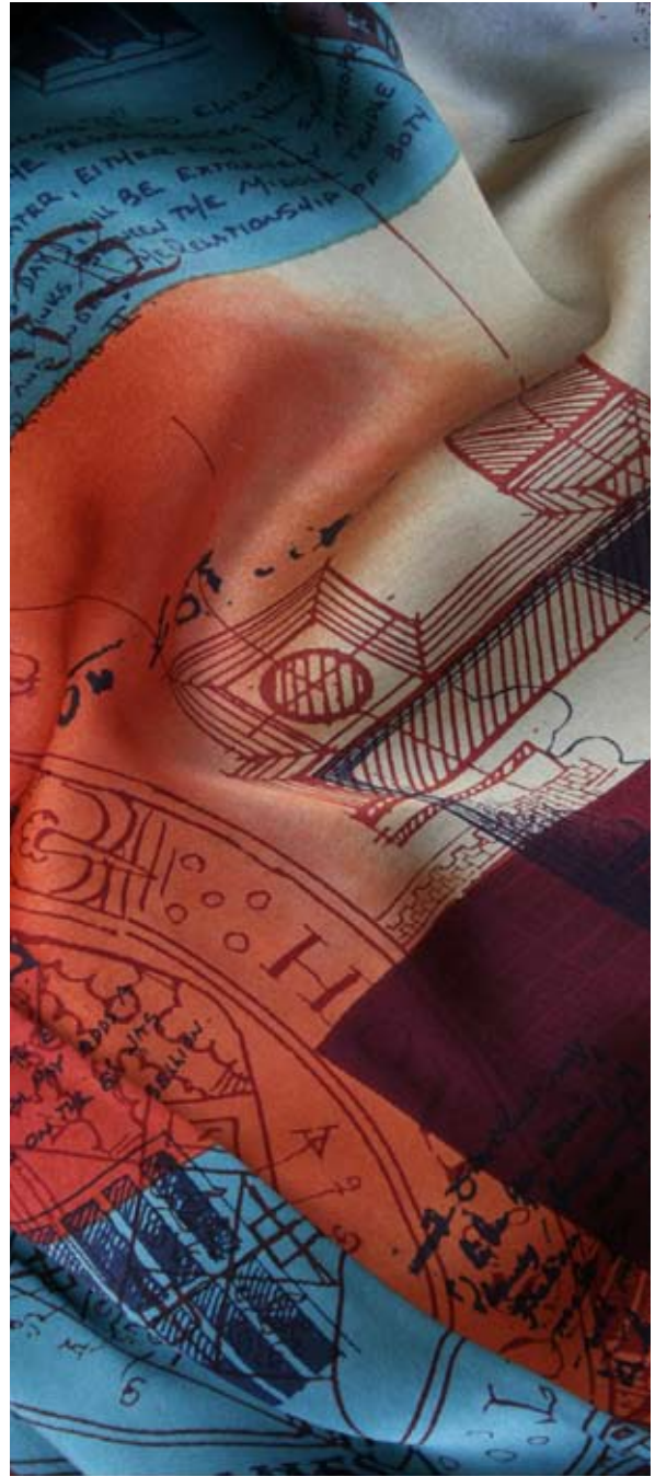
Hand painted and printed silk panel, Guggenheim Museum, New York Hand painted and printed silk scarf 2006 British Museum, London