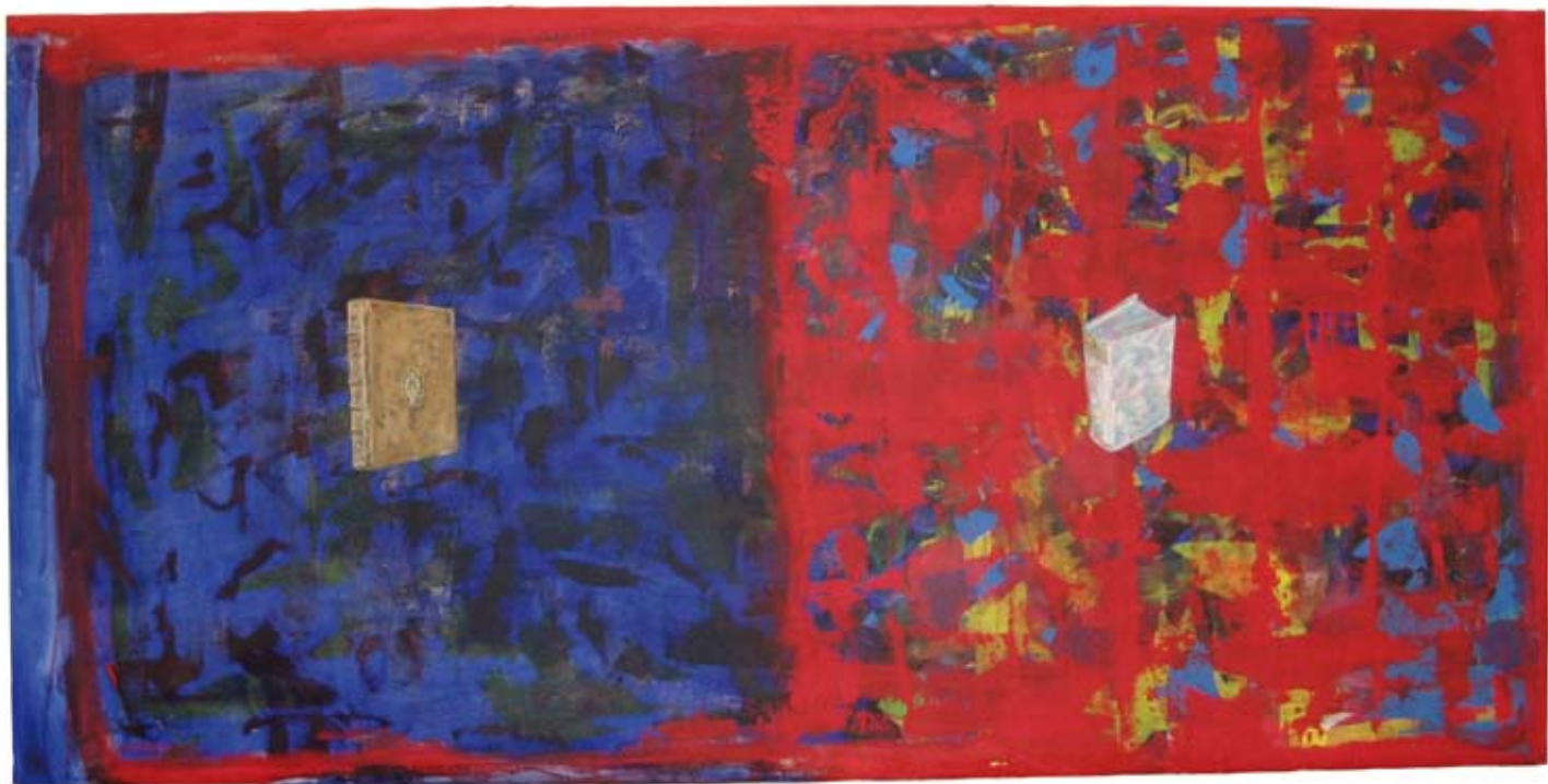
ELCHARDJA 2007 oil on canvas 99 x 198 cm